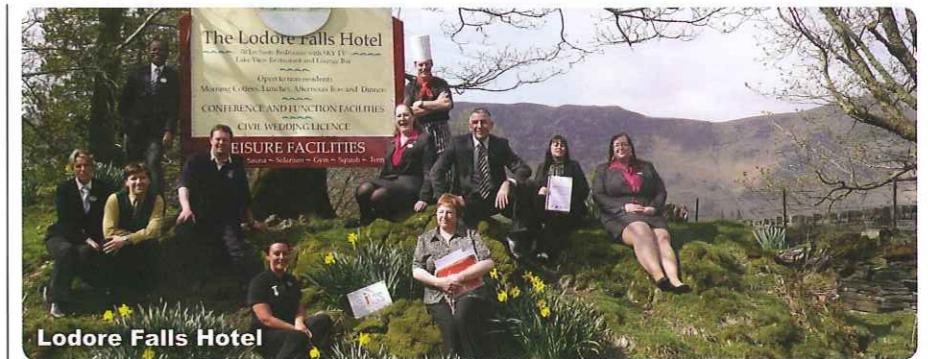
Lodore Falls Hotel

Hoar Cross Hall is recognised as 'the only spa resort in a stately home in England'. Set in 100 acres of landscaped gardens, it has seven function rooms, 99 bedrooms and a nine-hole golf course. Visit www.hoarcross.co.uk .