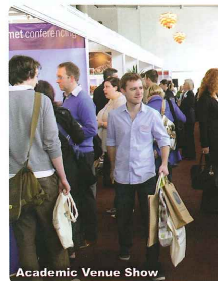
Academic Venue Show